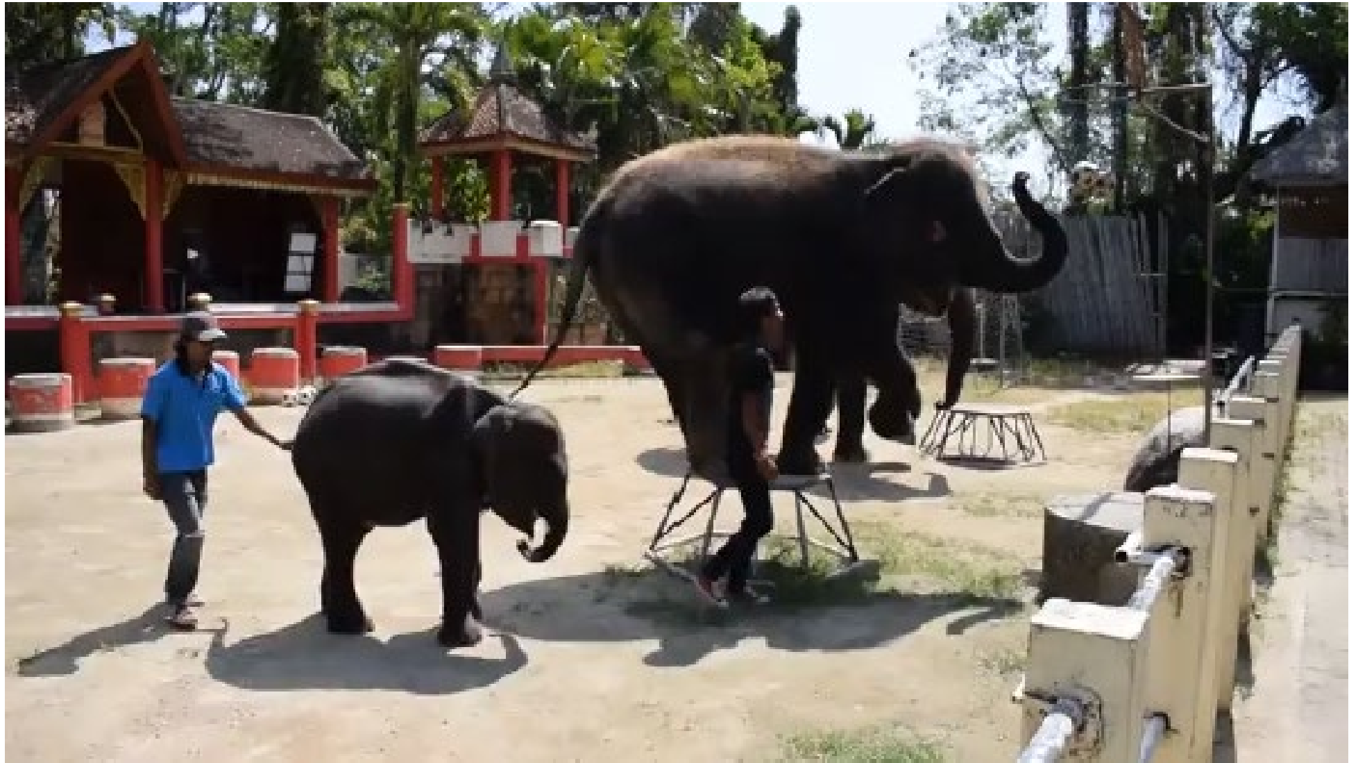
Elephants 'dance' to rave music played instruments and use hula-hoops after training with painful bullhooks.